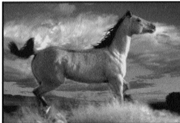
Tárláirín - Buckskin Quarter Horse

The Livestock Board number is 841-6161 (Albuquerque). The number for Bomar Equine Rescue is 861-0659 (Belen).